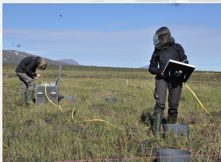
Field work.

mines the energy available for thawing the ice in the soil. A spatial climate distribution with a temperature gradient that increases exponentially when going inland was found. There is a high diversity of plant species which occur in a mosaic pattern of low dwarf-shrub heath and fen. Soil properties vary with respect to drainage conditions: as expected, wet soils are found to have higher concentrations of carbon (C) and nitrate (N) than well-drained soils. Generally, concentrations of solid C and N are low and highest in the top of the profiles. Methane (CH 4 ) emissions were measured over two weeks in July 2011. Correlations between CH 4 fluxes and soil water content and soil temperature were expected to be found but could not be confirmed by measurements due to the short period of measurement – hence the results show a snapshot of the arctic midsummer conditions. When upscaling the flux values to Flakkerhuk, the net balance for CH 4 at the study site over two weeks surprisingly suggest a minor sink of CH 4 . Applying a permafrost model, it is shown that the thermal properties of the soil type have a major effect on its melting potential during the arctic summer. It is shown that, due to permafrost thawing, it is unlikely that Flakkerhuk will change into a major source of CH 4 in the future with the current water balance.