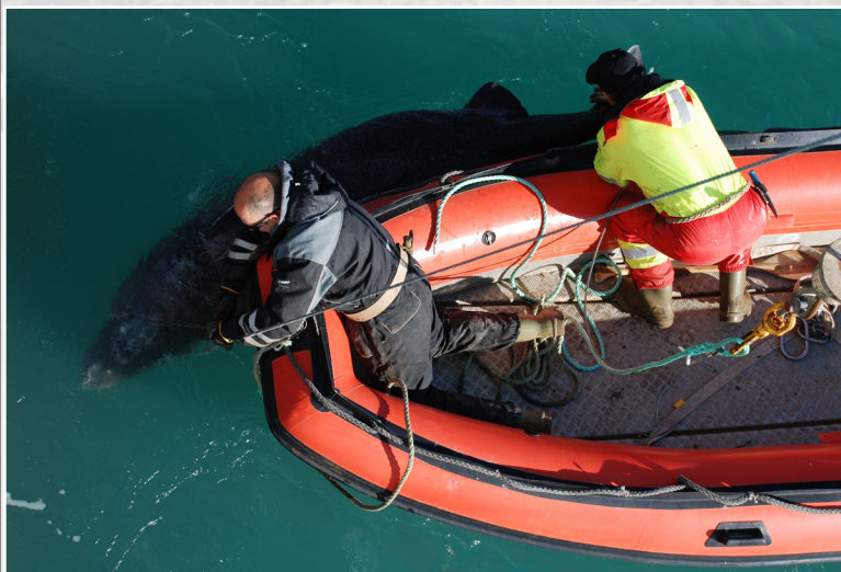
Tagging of Greenland shark.