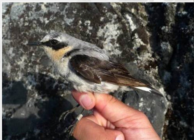
Wheatear ( Oenanthe oenanthe ).

The purpose of this project is to investigate the migration routes and wintering areas of Greenlandic wheatears using light loggers. This is a novel technique which has given rise to new possibilities in the field of bird migration with focus on small passerines. We use light loggers that weigh less than 1 g, and they log information on sunrise and sunset combined with a clock. This information can be used to determine the location of the birds during different phases of their migration and wintering cycle. At present, the routes and stopover sites used by Greenlandic wheatears are unknown and this project offers a unique opportunity to answer the open questions of where and how far these birds fly before they stop to rest. The birds were caught in traps and light loggers were mounted on their backs. We used only adult birds that were breeding in the vicinity of the Arctic Station in order to maximise the chances of catching the same individuals again next summer. 18 birds were caught and equipped with loggers. In order for the information to be downloaded and analysed, the birds have to be caught again next summer.