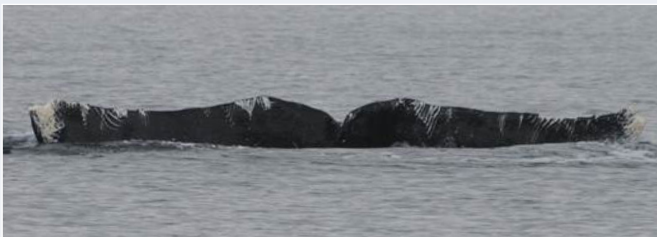
Bowhead whale tail fin with scars from Orca attacks. The scars appear as parallel white lines. Additionally, the tips of both sides of the fin are missing, presumably they have been bitten off.