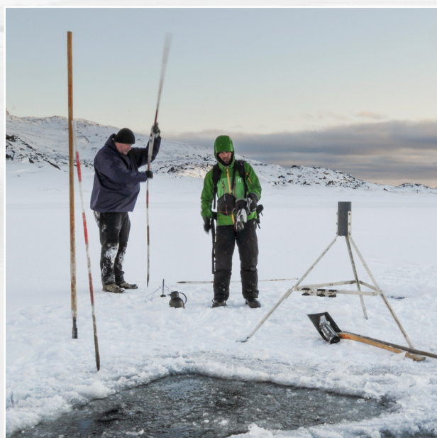
Field work at Kangaarsuk, deploying measuring equipment.

The purpose of this project is to establish a limnological monitoring programme in two lakes on Disko in order to detect seasonal dynamics and inter-annual changes in lake ecology. It has been shown that Arctic lakes are very sensitive to climate change and it is therefore important to